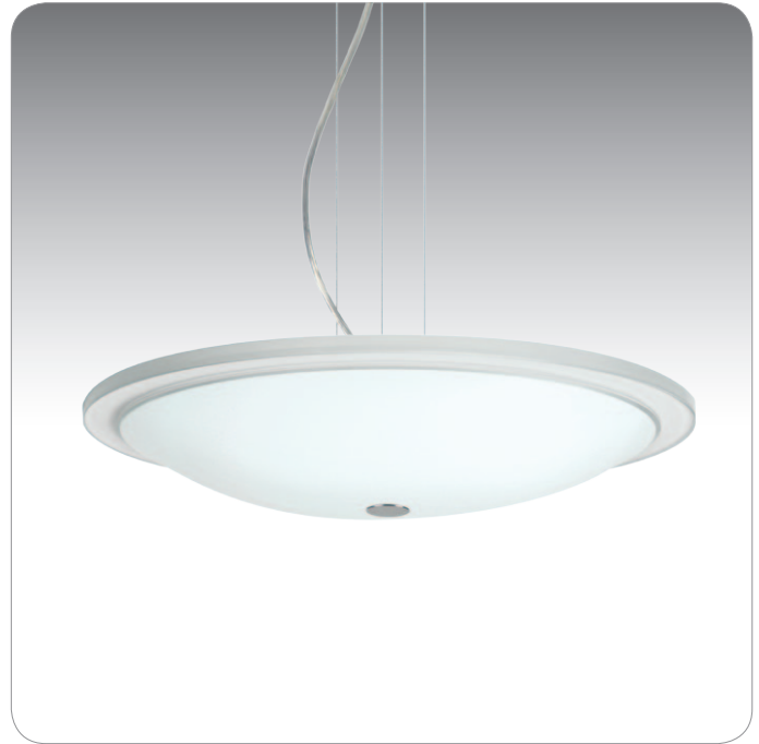
MANTA SHOWN IN OPAL GLOSSY

UL or ETL Listed. Suitable for Damp Locations (interior use only).